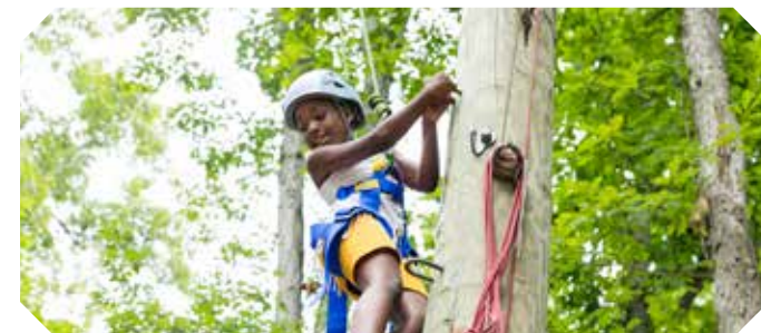
Kids discover what they can achieve through our Adventures In Respect program at our Capt. KRV Outdoor Leadership Center