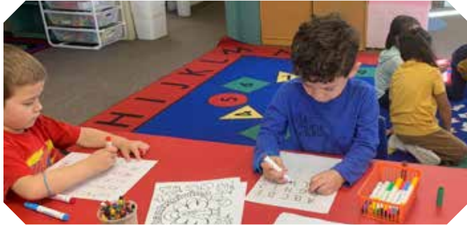
Kids learn, play and thrive in our child care programs