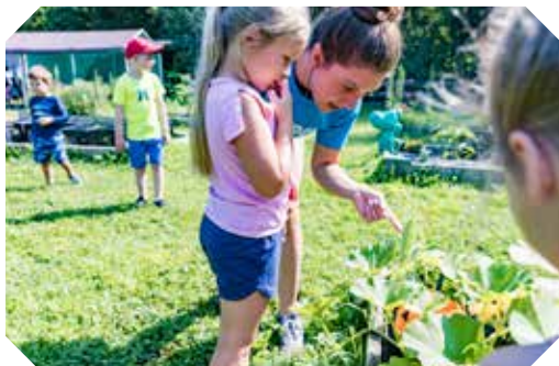
Campers explored our educational garden this summer