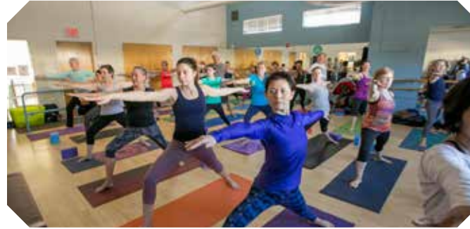
YMCA members are active and connected with their community at our YMCA