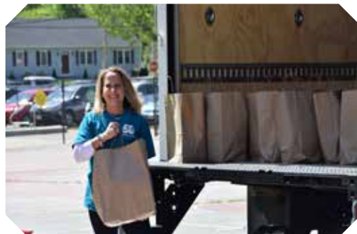
Staff and volunteers provided 19,789 bags of groceries in 2022 valued at $50 each to help eliminate hunger in our communities