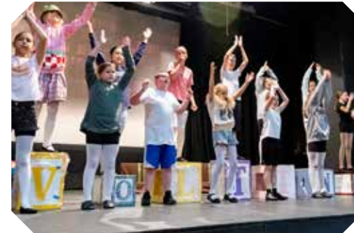
Our Theatre program performed 4 summer camp productions