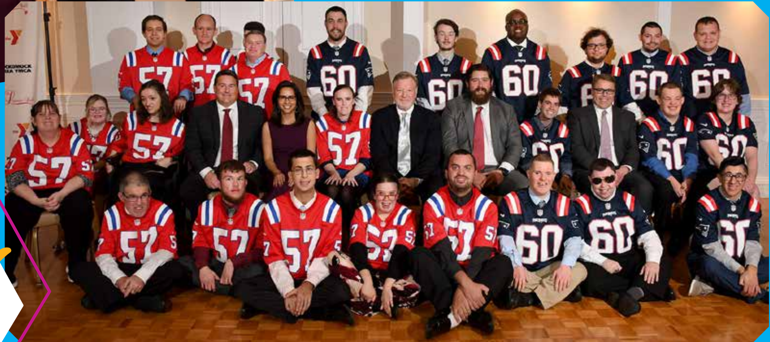
Photo below: Integration participants join YMCA leaders and Legends Honorees for a group photo at Legends Ball. This signature event celebrates inclusion and raises critical funding needed to support children, teens and adults with disabilities to participate in YMCA programs and activities alongside their typically developing peers.