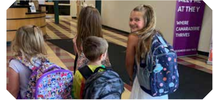
2,875 fully stocked backpacks were donated to students in our 15 communities