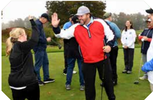
Our Legends Golf Classic was held at TPC Boston in October supporting our Integration Initiative