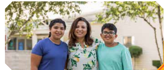
Families enjoy being active and having quality time together