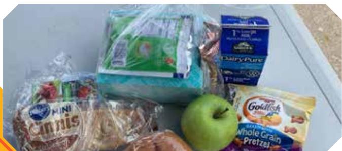
Our Food Access initiative served 51,237 grab and go meals to feed children in our communities in 2022