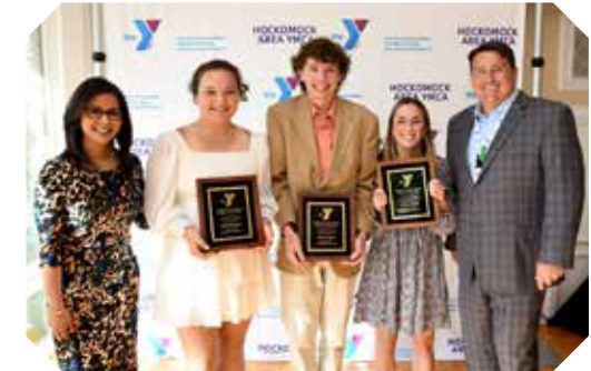
Outstanding teen leaders are recognized as Youth of the Year recipients at our Annual Meeting