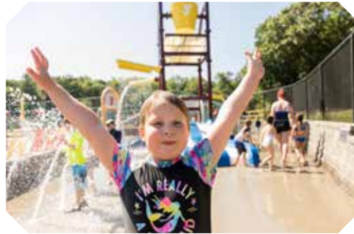
Kids enjoy learning how to swim and be safe around water