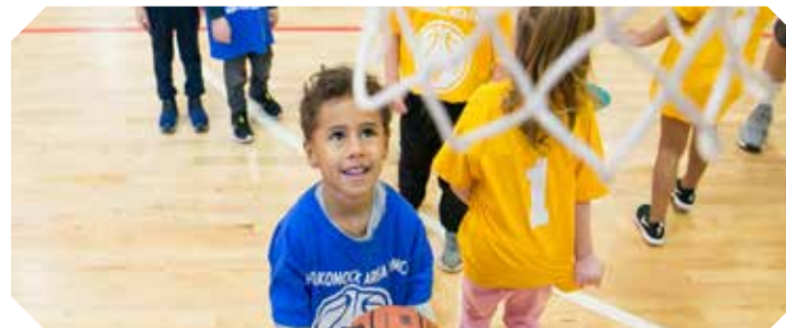
Kids play, grow and thrive in our programs