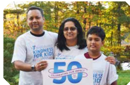
Our YMCA celebrated 50 years of impact in 2022