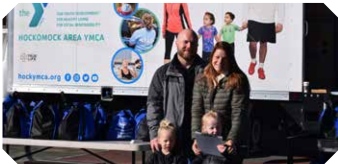
Dedicated volunteers and staff distributed 500 Thanksgiving meals to our neighbors in need