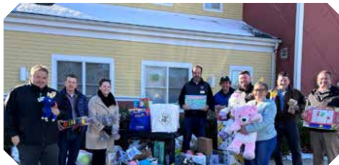
Together with our generous community, we were able to provide 1,000 gifts to families in need during the holidays