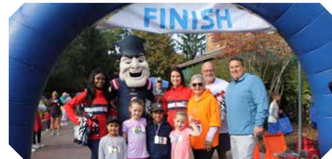
The community participated in our Spier Family Kindness for Kids 5K & Family Day at Patriot Place with proceeds helping to fight hunger through our Food Access initiative