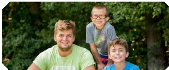
Innovative and safe summer camps were offered at 5 locations serving 3,373 campers