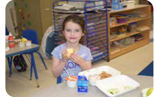
Provided child care to 787 children from infant to school age, keeping children safe and supporting working parents in our communities