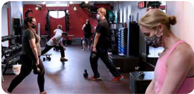
Stronger Together, a premier personal training program, was launched at our Bernon Family Branch