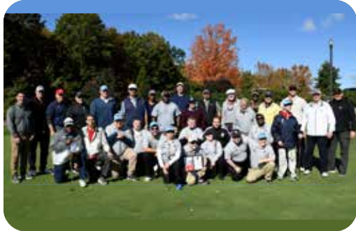
Our Legends Golf Classic was held at TPC Boston in October supporting our Integration Initiative