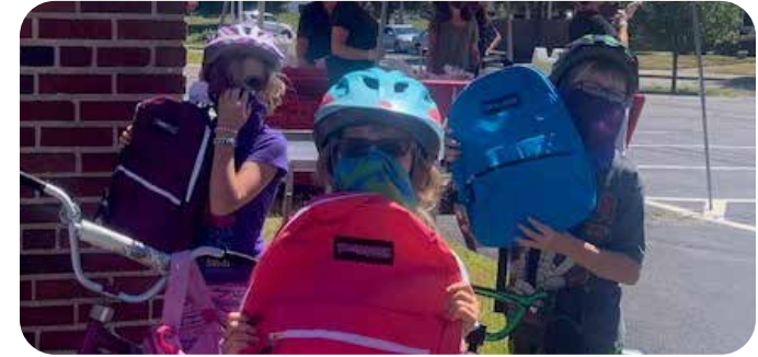
2,800 fully stocked backpacks were donated to students in all 15 communities