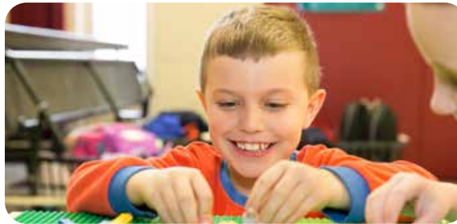
Kids play, grow and thrive in our child care programs