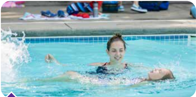
Kids enjoy learning how to swim and being safe around water