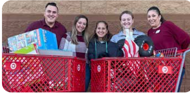
Together with our generous community, we were able to provide 651 gifts to families during the holidays