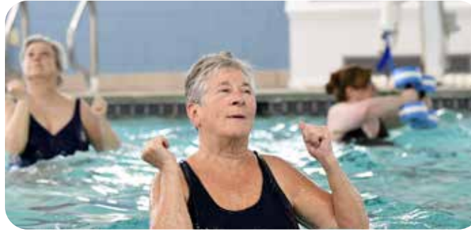
YMCA members stay active and connected with their community