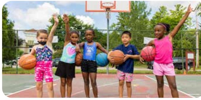
Innovative summer camps were offered at all branches serving 1,425 kids per week