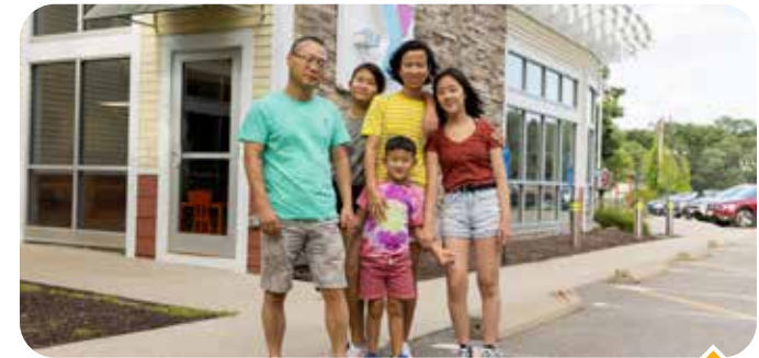
Families enjoy being active and having quality time together