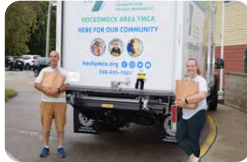
Staff and volunteers provided 25,020 bags of groceries in 2021 valued at $50 each to people in need in our communities