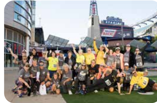
Our LIVESTRONG at the YMCA program participants and alumni at the Spier Family Kindness for Kids 5K & Family Day