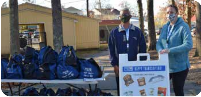
Dedicated volunteers and staff distributed 505 Thanksgiving meals