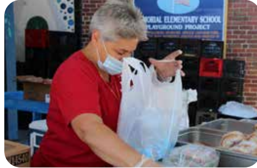
Our Food Access initiative served 154,672 grab and go meals to feed children in our communities in 2021