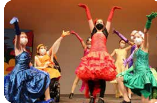
Our Theatre program held many successful performances, programs and summer camps