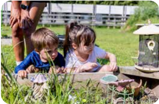
Campers explored our summer educational garden