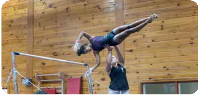
Gymnasts gain confidence and skills