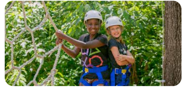
Kids discover what they can achieve at our Kyle R. Van De Giesen Outdoor Leadership Center