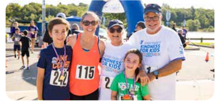
The community participates in our Spier Family Kindness for Kids 5K & Family Day at Patriot Place with proceeds helping to fight hunger through our Food Access initiative