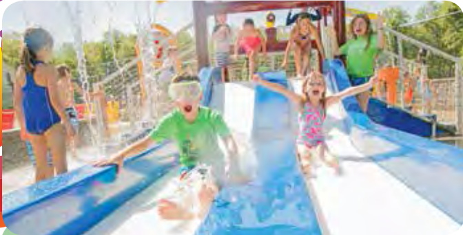
Campers at our Bernon Family Branch enjoy our Rockland Trust Family Splash Park