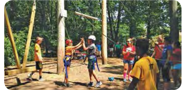
Teens congratulating each other during our Adventures in Respect program at the Capt. Kyle Van De Giesen Outdoor Leadership Center