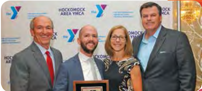
CVS Health receives the LIVESTRONG at the YMCA Community Champion Award