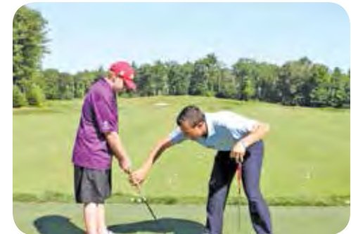
Integration Initiative golf clinic at TPC Boston