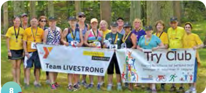
Team LIVESTRONG and the Try Club at our Triathlon