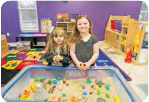
Kids play, grow and thrive in our child care programs