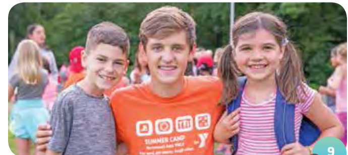
1,215 individuals were employed by our YMCA in 2017, 26% of staff were under age 18