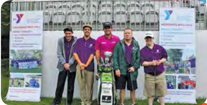
PGA Tour Professional Patrick Reed with our Unified Golf Team at the practice round of the Dell Technologies Championship