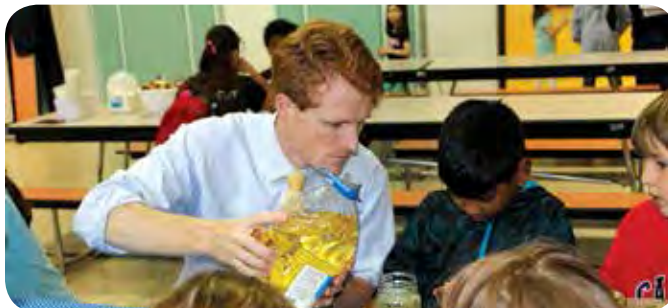
Congressman Joe Kennedy visits our after school care program making lava lamps with kids as part of our STEM learning