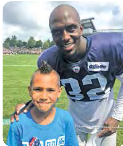
Patriots Captain Devin McCourty greets Davion at Training Camp