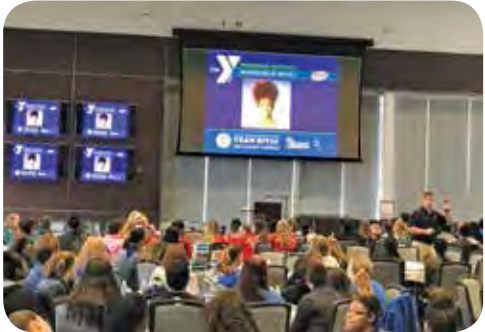
Team Rival, a peer leadership conference at Gillette Stadium created by the Norfolk District Attorney's Office