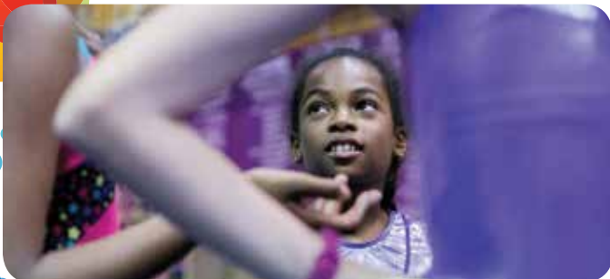
Gymnasts gain confidence and skills in our youth programs