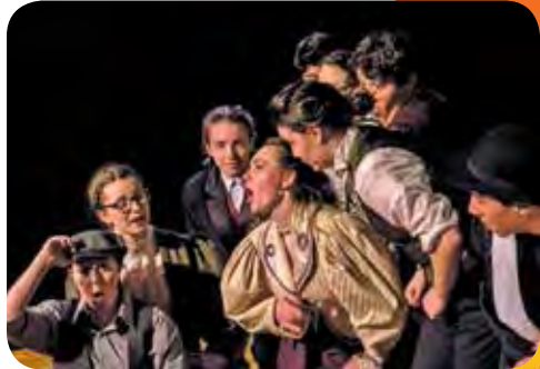
Our Youth Theatre program performs