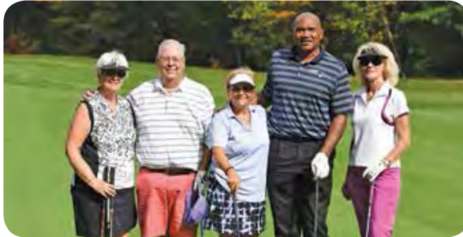
Friends and sponsors enjoying our Legends Golf Classic at TPC Boston