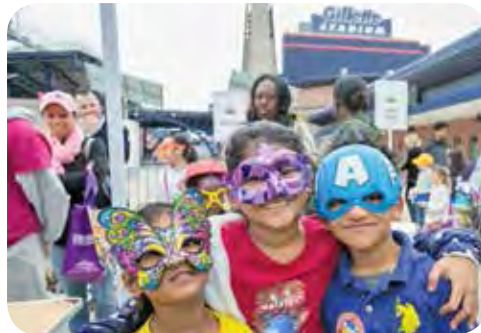
Families enjoy being active and having fun at our Healthy Kids Day at Patriot Place