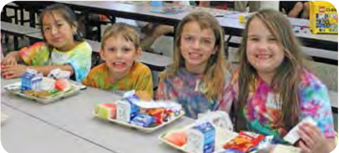
New friendships being made over healthy lunches at our Milford Summer Food Service Program