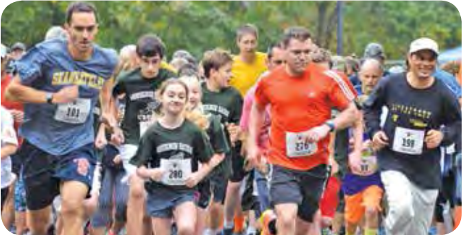
The starting line at our Foxboro 5K