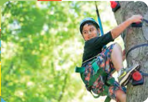
Kids explore our tree climbing elements at summer camp