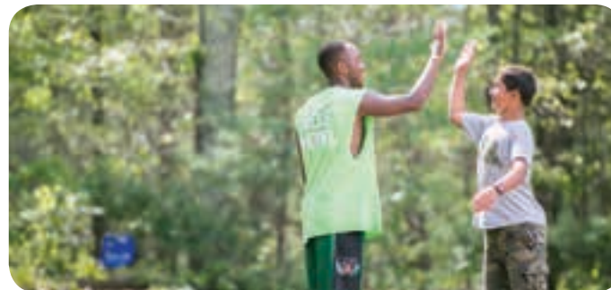
Staff role models reinforce confidence and healthy habits every day