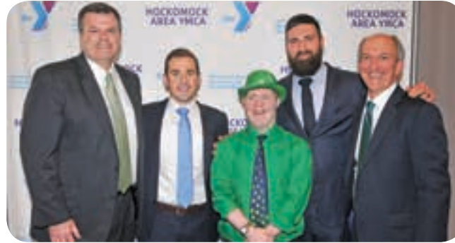
Our 2016 Reach Out for Youth & Families Annual Campaign Breakfast