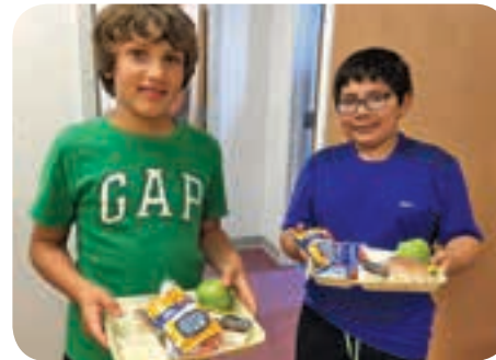
New friendships were made at our Milford Summer Food Service Program over a healthy lunch