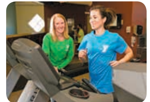
New innovative fitness equipment installed at all branches