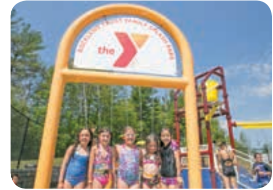
Kids enjoy exploring at our Rockland Trust Family Splash Park