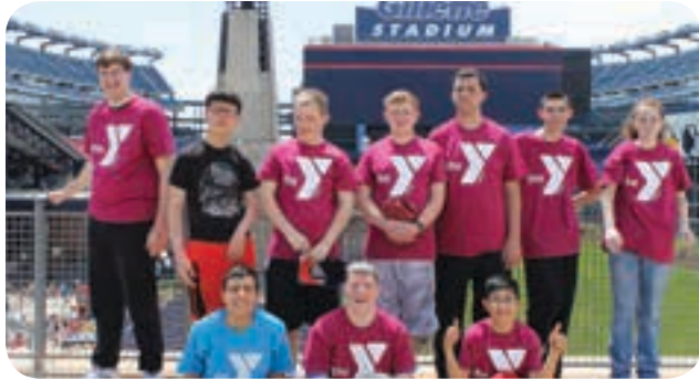
Integration Initiative participants volunteer at Healthy Kids Day