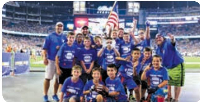
Y Flag Football campers celebrate after playing during halftime of a New England Patriots preseason game