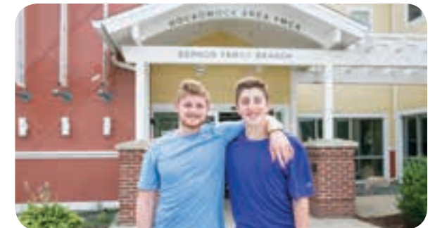
Our YMCA provides a place to belong