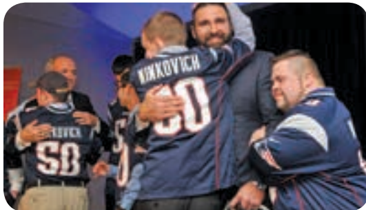
Our 2016 Legends Ball Honoree Rob Ninkovich is embraced by Integration Initiative participants