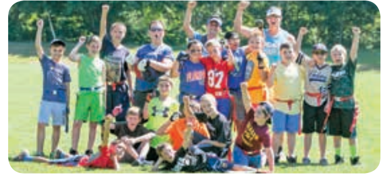
Y summer campers enjoying the Best Summer Ever