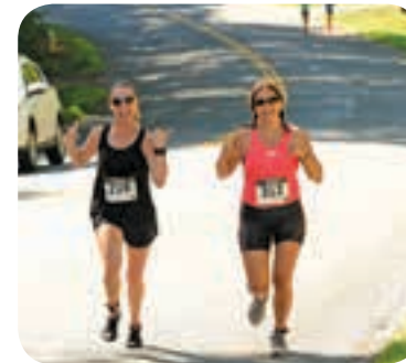
Our 11 th annual Y Triathlon was held at Lake Pearl