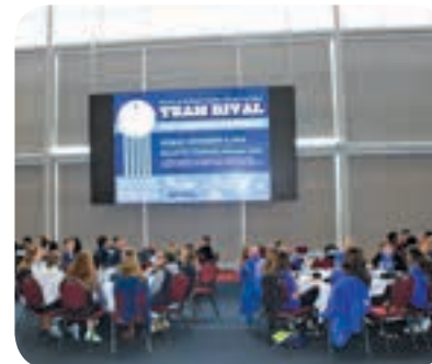
Team Rival, a Norfolk County peer leadership conference at Gillette Stadium