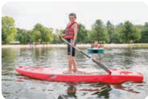
Campers at our Camp Silver Lake in Bellingham enjoy time on the water