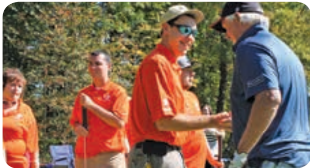
Legends interact with Integration Initiative team members at our Legends Golf Classic at TPC Boston