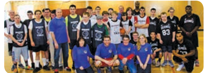
The Christopher R. Morrissey Basketball 4 All Tournament celebrates inclusion