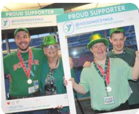
Our Integration Initiative participants show their support at our Annual Campaign Breakfast at Gillette Stadium.