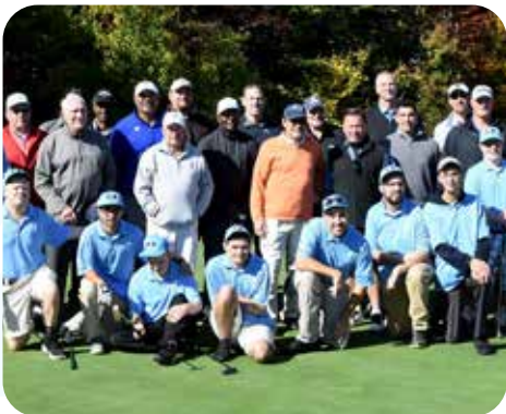
Legends and our Unified Golf Team at the Legends Golf Classic at TPC Boston.