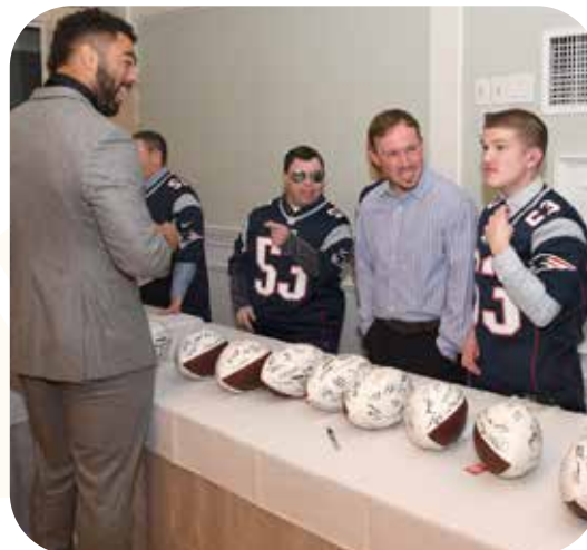
Integration Initiative participants welcome our 2019 Legends Ball Honoree Kyle Van Noy to Legends Ball.