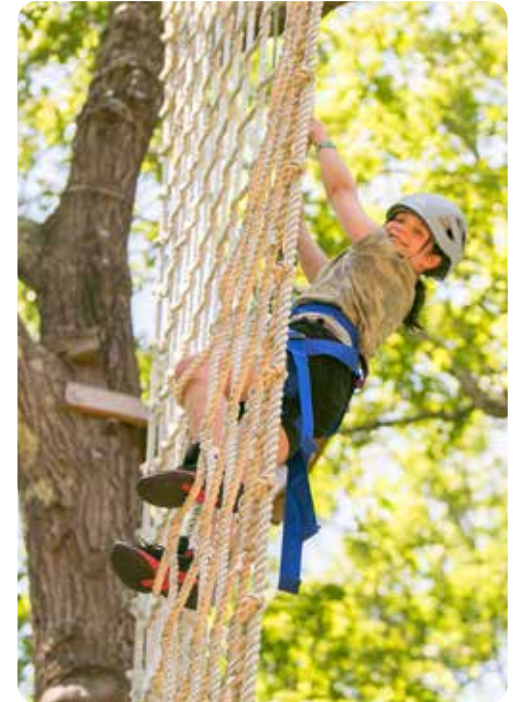
Bristol County Savings Bank has been a long time supporter of our Y's Adventures in Respect bullying program.

The Hockomock Area YMCA is honored to present the Chair's Award to Bristol County Savings Bank.