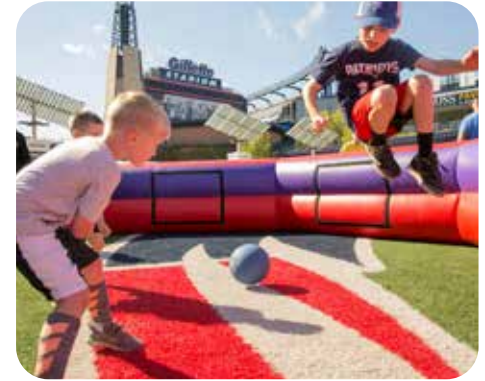
Kids and families experiencing Healthy Kids Day at Patriot Place.