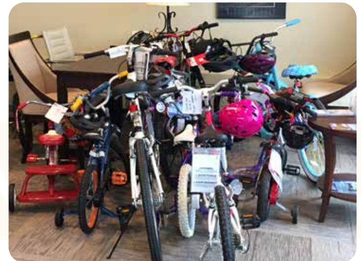
West Side Benevolent Circle's "Gift of Hope" program provides bikes to kids in need.