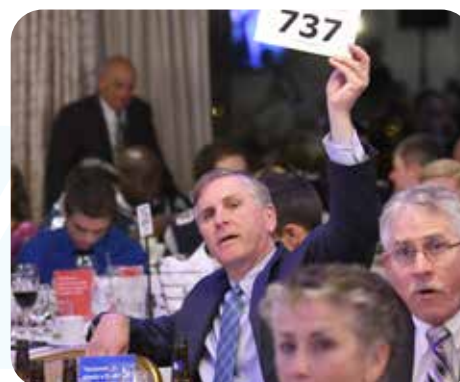
Community partners support our powerful innovative Integration Initiative at our 14th annual Legends Ball.