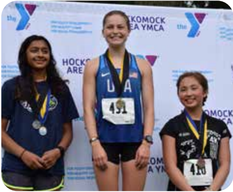
Athletes compete at the Spier Family Triathlon at Lake Pearl.