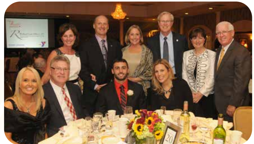
Bristol County Savings Bank has supported the YMCA's Integration Initiative at our Legends Ball.