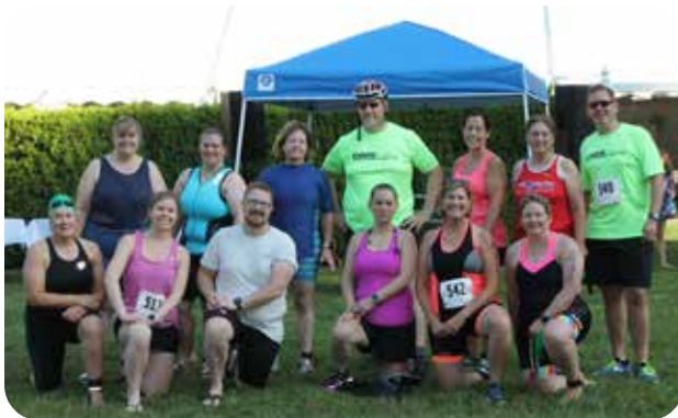
Weight to Change participants at our Spier Family Triathlon.