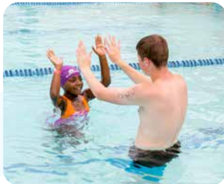
Kids learn to swim, have fun and be safe around water.