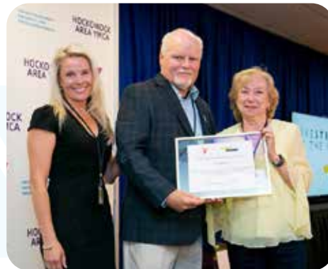
Volunteers are recognized at the 2019 LIVESTRONG at the YMCA celebration event.