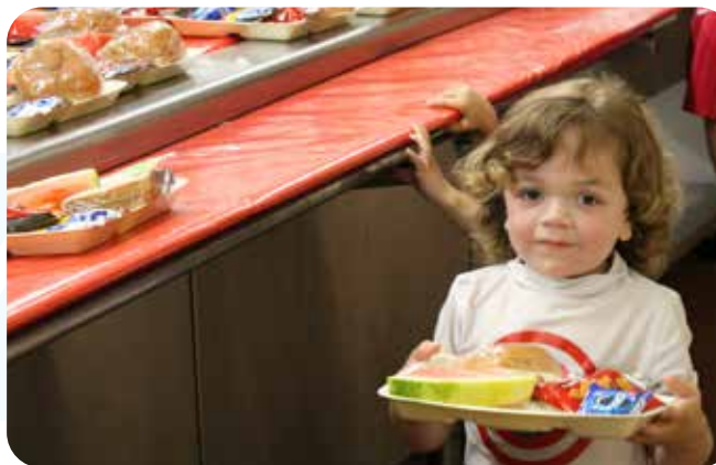
A child enjoying a nutritious lunch.

"Our missions are very well aligned with goals that overlap and keep our kids at the center of our focus."