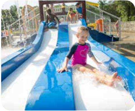
Youth enjoying the Rockland Trust Family Splash Park at our Bernon Family Branch.