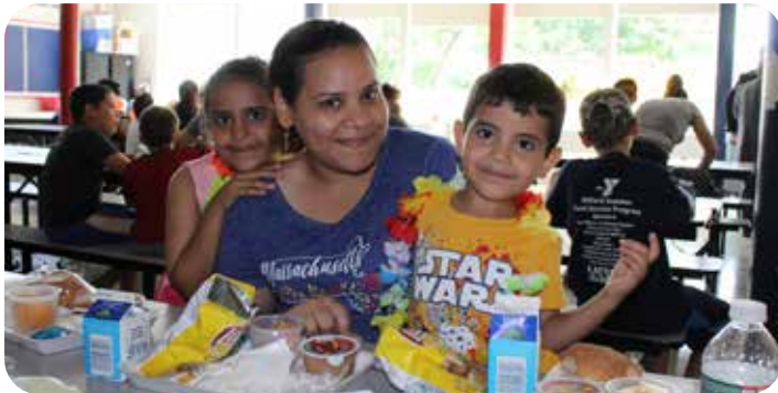
A family enjoying lunch at the Milford Summer Lunch Program at Memorial Elementary School.

The Hockomock Area YMCA is proud to present Milford Public Schools with the Bernon Family Branch Red Triangle Award.