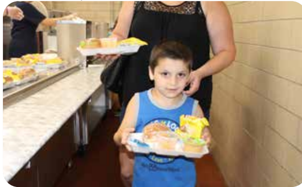
A child receives lunch at our Milford Summer Food Service Program at Memorial Elementary School.