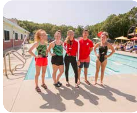
1,255 individuals were employed by our YMCA in 2019, more than half were 18 or younger.