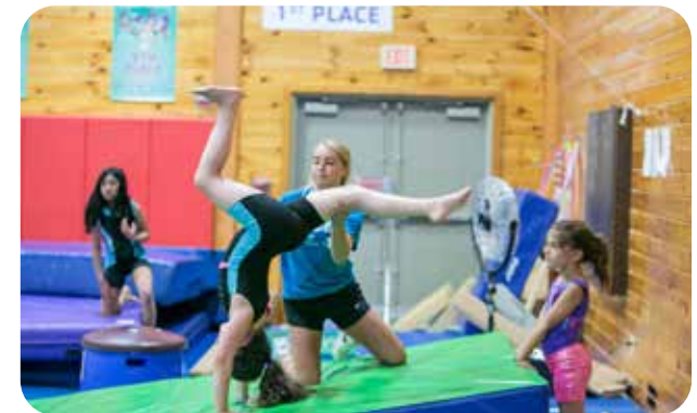
Youth gain confidence in our gymnastics programs.