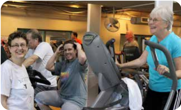
LIVESTRONG at the YMCA participants enjoying fellowship and support.