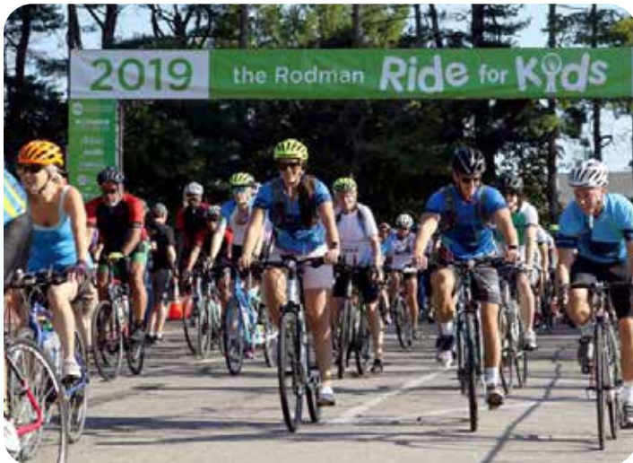
Dedicated riders at the Rodman Ride for Kids in 2019.