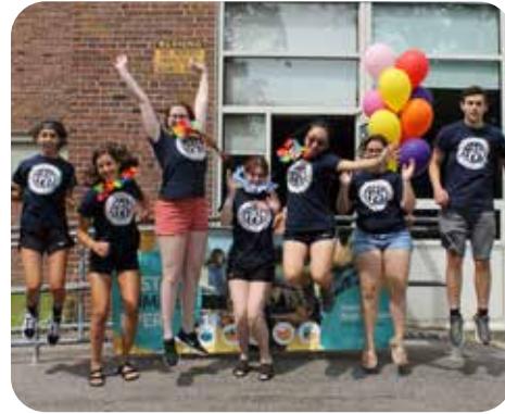
Youth and teens volunteer at our Milford Summer Food Service program.