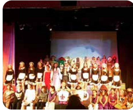
Our theater program performs Beauty & the Beast .