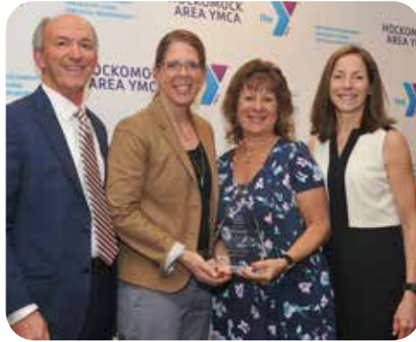
CVS Health receives the Chair's Award for its leadership and dedication to enriching the quality of life in our community.