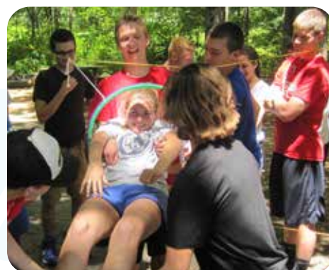
3,750 students participated in our Adventures in Respect bullying prevention program from 13 communities.