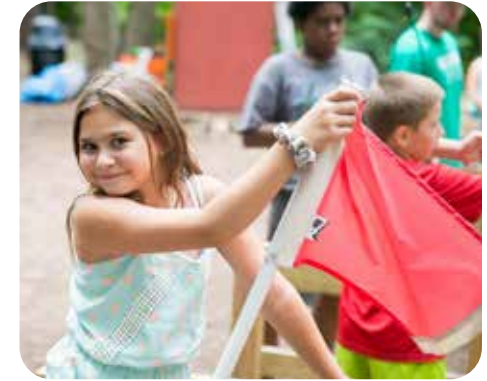
4,373 campers enjoyed their best summer ever.