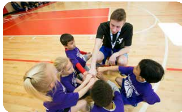
Kids learn team work in our Youth Basketball League.