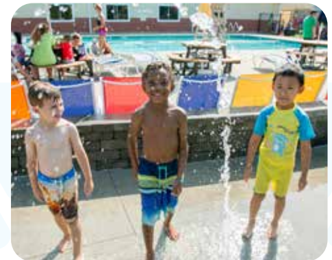
Campers make friends and gain confidence at Y summer camp.