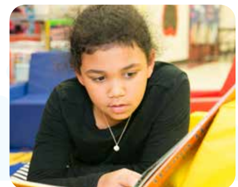
826 children were nurtured in our licensed child care programs.