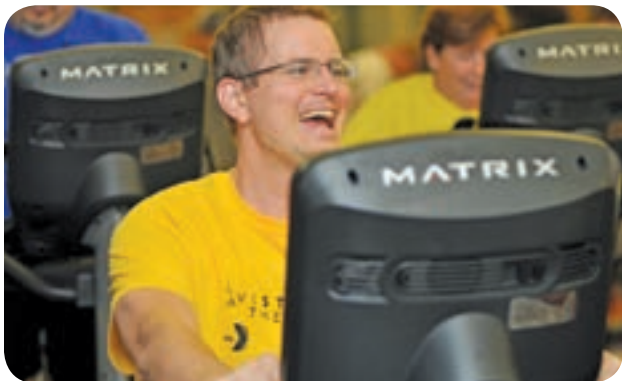
Participants in our LIVESTRONG at the YMCA program reclaim their total health