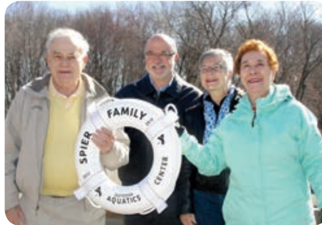
The 2012 dedication of the Spier Family Outdoor Aquatics Center