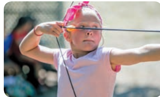
Campers experience new things and gain confidence at Y summer camp