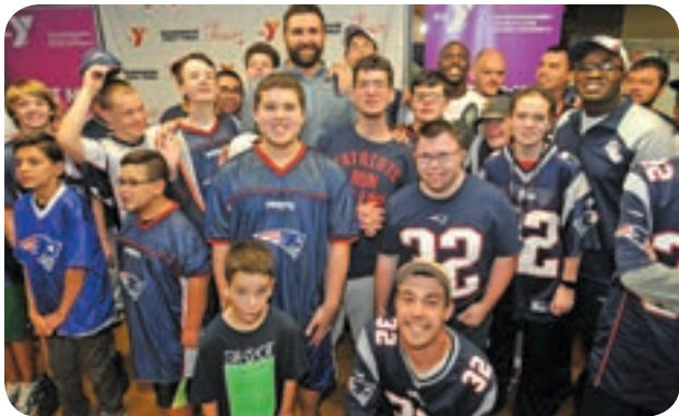
Our 2016 Legends Ball Honoree Rob Ninkovich celebrates with members of our Y's unified flag football team