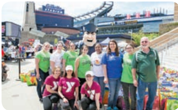
Stop & Shop and Y staff prepare healthy living bags for Healthy Kids Day families at Patriot Place