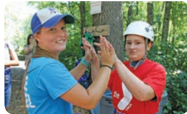
New Horizons campers challenge themselves on our ropes courses