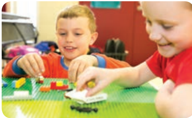
STEM curriculum is incorporated into our early learning programs