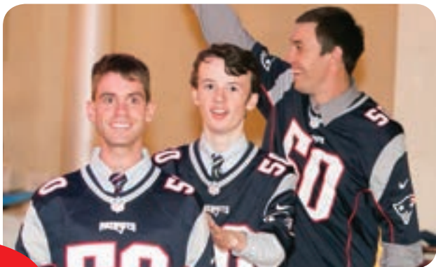
Integration Initiative participants smile as they acknowledge the crowd at the 2016 Legends Ball