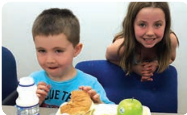
Nutritious lunches were prepared each day for youth and families at our Milford Summer Food Service Program