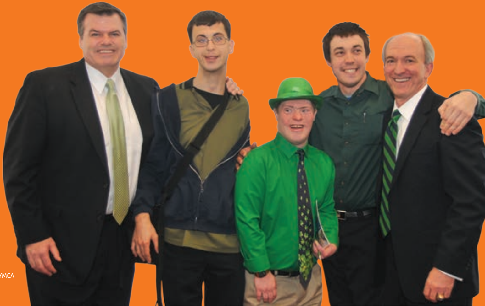
FRONT COVER: Hockomock Area YMCA summer campers